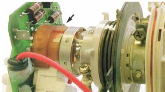
PEI 1000 clamp on video display unit

The price/performance ratio of these materials slots between the conventional engineering plastics and premium materials like PEEK.