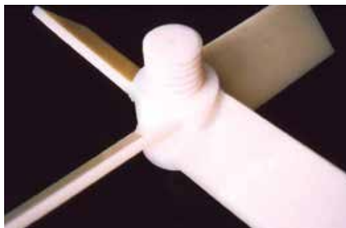
Machined parts of SYMALIT PVDF