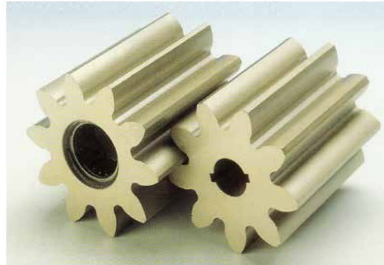
KETRON® PEEK 1000 gears for pneumatic hand drill

This 30% glass fibre reinforced grade offers a higher stiffness, strength and creep resistance than KETRON PEEK-1000 and has a much better dimensional stability. This grade is ideal for structural applications supporting high static loads for long periods of time at elevated temperatures. The use of KETRON PEEK-GF30 is not recommended for sliding parts since the glass fibres tend to abrade the mating surface.