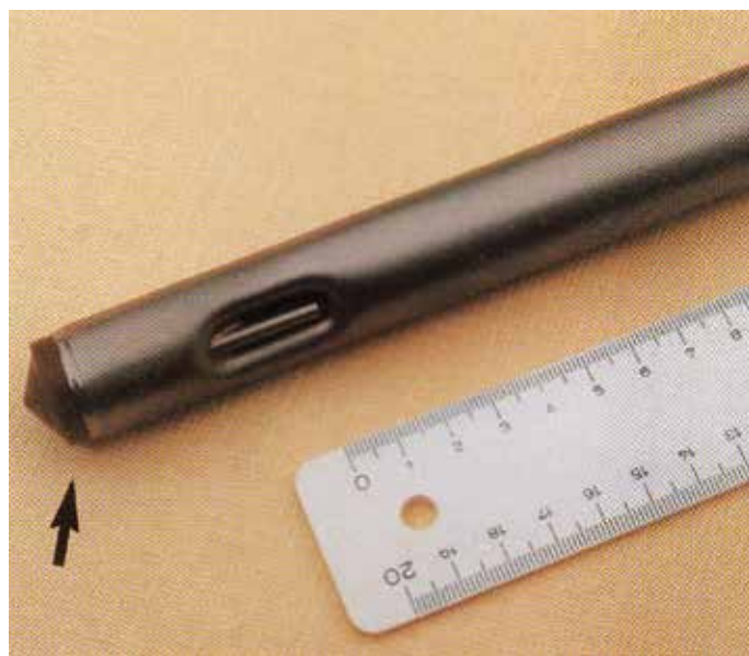
KETRON® PEEK 1000 protection cap for oil measuring probe

This 30% carbon fibre reinforced grade combines even better mechanical properties (higher E-modulus, mechanical strength and creep resistance...) than KETRON PEEK-GF30 with an optimum wear resistance. Moreover, the carbon fibres provide 3.5 times higher thermal conductivity than unreinforced PEEK - dissipating heat from the bearing surface faster.