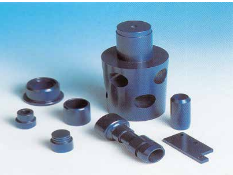
Machined parts of TECHTRON®1000 PPS

TECHTRON® HPV PPS is a reinforced, internally lubricated semicrystalline polymer developed to close the gap both in performance and price between the standard thermoplastic materials (eg. PA, POM, PETP, ...) and the high end Advanced Engineering Plastic Products (eg. PBI, PI, PAI, PEEK, ...).