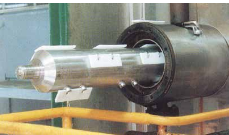
ERTACETAL® scraper blades on a gelatine extruder

ERTACETAL is very well suited for machining on automatic lathes and is particularly recommended for mechanical precision parts.