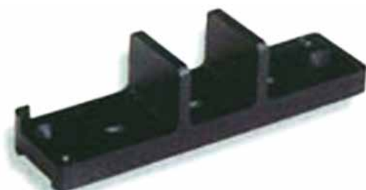
Light Bulb contact part