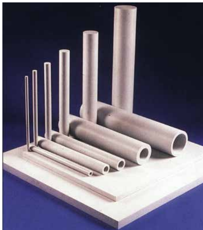
ERTACETAL® stock shapes