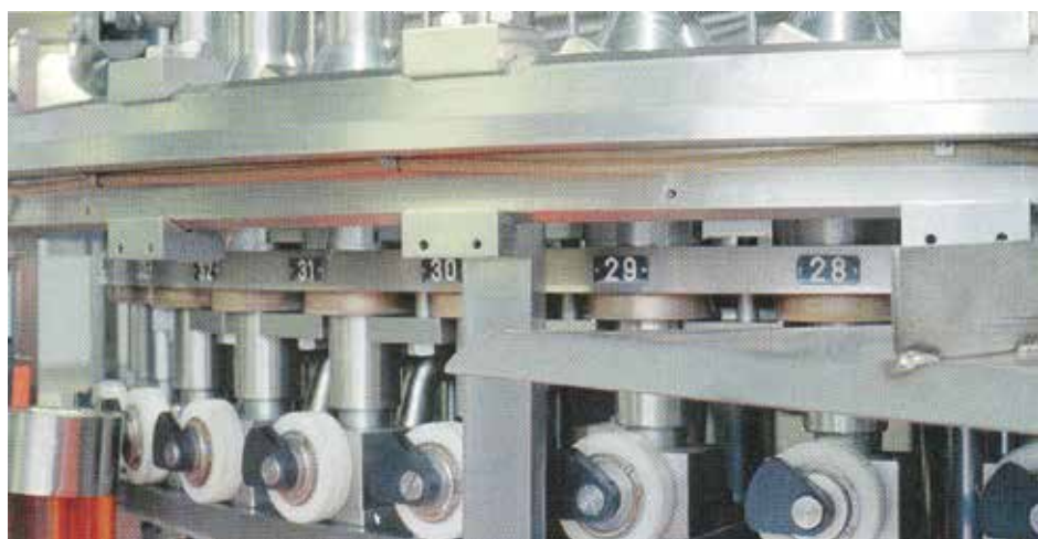
ERTALYTE® camrollers on can filling machine